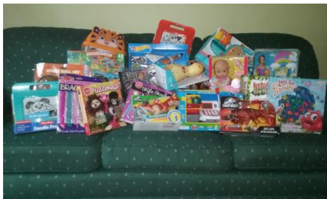
FISH Food and Toy Donations

More notes of thanks come in the mail every day. They are posed on the bulletin board for you to see.